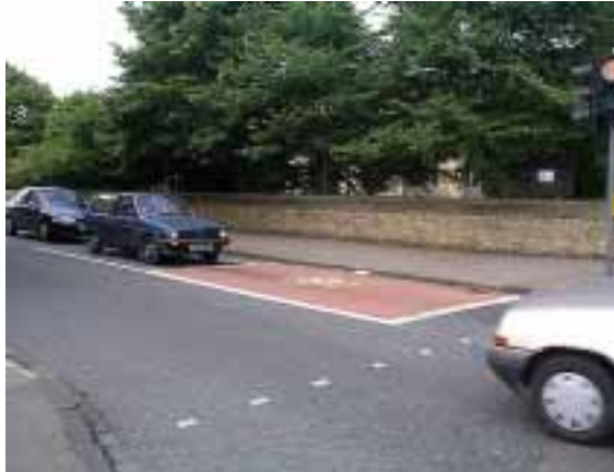
Simple but effective: an advanced stop line on Coldham's Lane

Advanced Stop Lines (ASLs) are a low-cost but highly-effective way of helping cyclists at junctions. They reallocate road space from motor traffic to cycles at precisely those locations where cycles have the greatest difficulty and where collisions are most likely to occur.