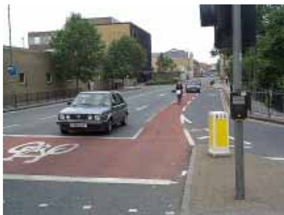
Below: Money well spent: East Road