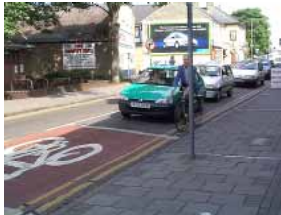
Below: Approach lane needed: Mill Road