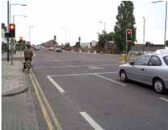
Red surface needed: Hills Road

This ASL did once have a red surface, but the red colour is now almost completely gone. In addition, part of the reservoir area has been patched with a black surface. Complete renewal is required.