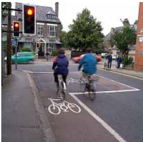
ASL with approach lane: Devonshire Road.

Appendix 2 contains a list of all the ASLs in Cambridge that do not have approach lanes. We believe all these should be given approach lanes.