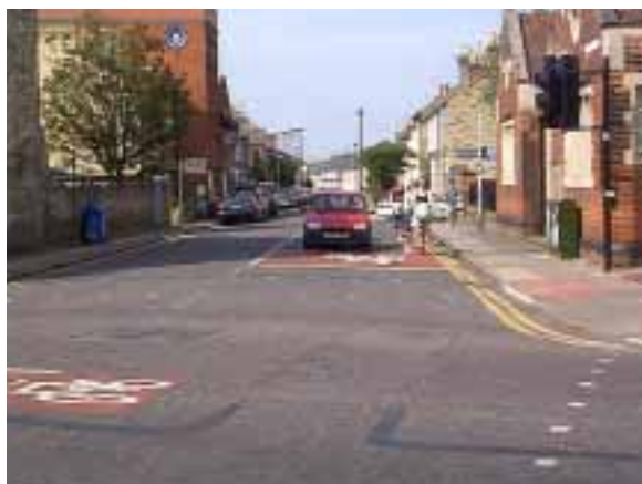
Above: Money well spent: Gwydir Street