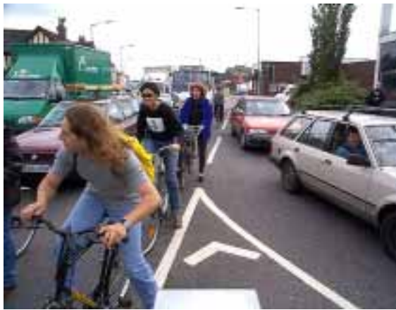
Above: Advanced stop line desperately needed: Newmarket Road/ Coldham's Lane

This is a very busy junction with a lot of conflict between cycles and motor vehicles. ASLs are needed on all approaches, especially to help cycles on Newmarket Road eastbound turning right into Coldham's Lane and to help cycles travelling westbound go straight-ahead. ASLs would also be of value at the River Lane junction nearby.