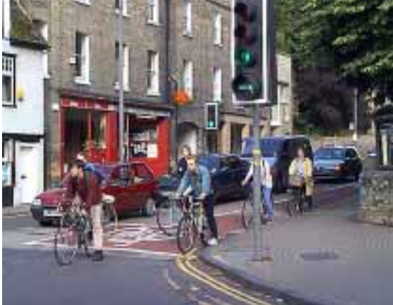
A full-width reservoir would allow right-turning cyclists to wait in the correct position: Castle Street

example, at Chesterton Lane approaching Magdalene Street the reservoir is no wider than the cycle approach lane. On the Castle Street approach to the same junction the reservoir only extends about two-thirds of the way across the lane.