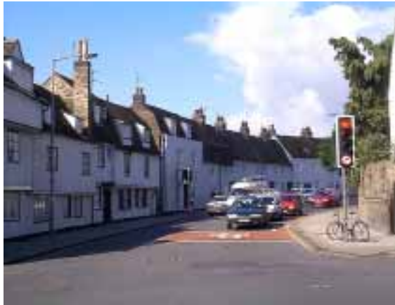
This cycle approach lane is too narrow compared with the width of the adjacent traffic lane: Northampton Street

times to reduce the number of lanes of normal traffic from two to one. Examples of this include the St Barnabas Road and Gwydir Street approaches to Mill Road. This is often desirable, because in addition to providing more road width for cyclists the single lane of traffic simplifies the traffic flow through the junction and reduces conflict with cyclists.