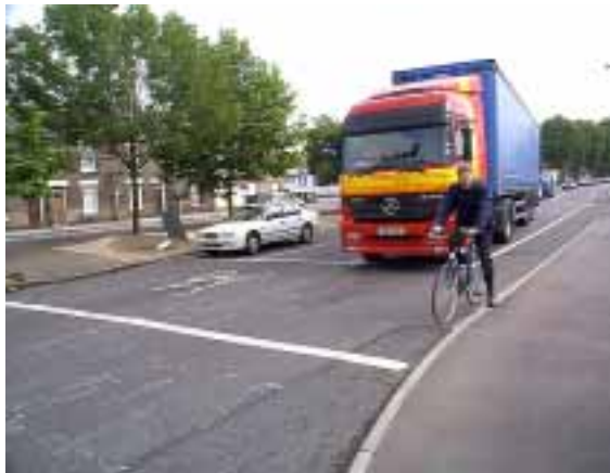
Red surfacing would make this advanced stop line even better: Newmarket Road

The design of ASLs is well described in the government's Traffic Advisory Leaflets on this subject (references 2 and 3, see Appendix 3), and the County Council has been designing ASLs locally for several years. It is nearly ten years since the first ASL appeared in Cambridge, and since then they have become fairly common. We do believe, however, that some of the ASLs in Cambridge have been more successful than others and with this experience in mind we would like to make a number of observations on their detailed design.