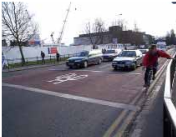
Cyclists turning right would benefit from a second cycle approach lane: Gonville Place

If there is a separate traffic lane for right-turning motor traffic, and the signals change to green whilst a right-turning cyclist is still using the cycle approach lane, then that cyclist becomes stuck in the wrong position on the road for turning right.