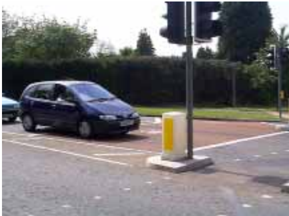
Above: A huge reservoir, but no approach lane: Queen Edith's Way

This is the only junction of the three where we have any sympathy for the claim that the road is not wide enough. Even here, however, narrow approach lanes should be provided. Even if the approach lane was encroached by buses and lorries it would still be of value by encouraging queuing cars to wait further away from the kerb that they do at present. If there is really no space for approach lanes then the ASLs should be removed.