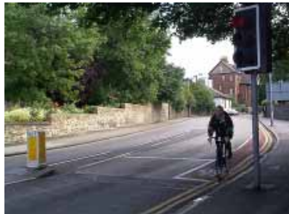
Below: Approach lane already provided - just add the reservoir: Chesterton Lane