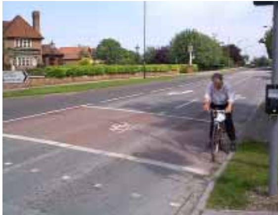
ASL without approach lane. This cyclist can only use it because there is no traffic: Fulbourn Road

We think this is a very poor arrangement. To provide an advanced stop line and reservoir without providing an approach lane is, we believe, pointless, because cycles are unable to reach the reservoir and use it.