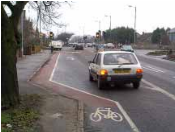
Above: This approach lane places straight-ahead cyclists in the wrong position on the road: Milton Road

If the left traffic lane is for left turns only then the cycle approach lane should be on its right (as at East Road/Mill Road) not to its left (as at Milton Road/King's Hedges Road).